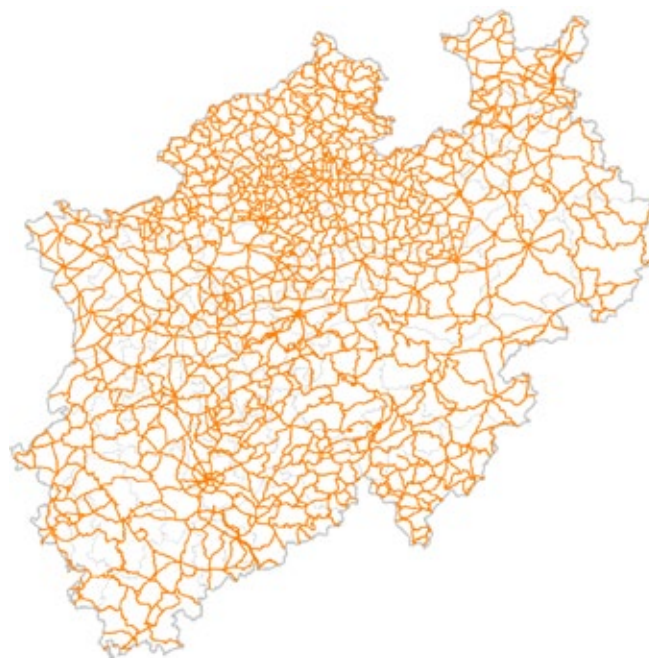
The NRW Cycle Network measuring 13800 km (8500 mi) in 2008.

Most German Länder now have regionally coherent systems of cycle signing. North Rhine-Westphalia (NRW) began working on a coherent system of signing for its cycle network as early as 1985. The Land has adopted many ideas from the Netherlands, where cycle route signing, together with general traffic signing, has been