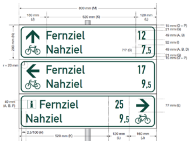
The design standard according to the ERA with hierarchy of main („Fernziel“) and secondary („Nahziel“) destinations.

For practicality and safety reasons, signs must be designed so that they can be easily read and understood at a glance from the typical distance of approaching cyclists. Cyclists should not be overloaded with information. Ideally, signposts should include no more than two destinations per direction, including distances. In order to show more destinations, signs could use abbreviated descriptions, such as 'Centre', or two signs could be combined. Additional information boards can be used to give more detailed information, such as an overview of the cycle route network, background information about places of interest and information on food and lodging in the area. All signs are designed in accordance with the standards specified by the ERA, with respect to sign size, colour, font and font size, as well as the use of symbols. Such standardisation not only ensures that users can easily recognise signage. The standards have also been designed to prevent cycle signs from being confused with other signing systems.