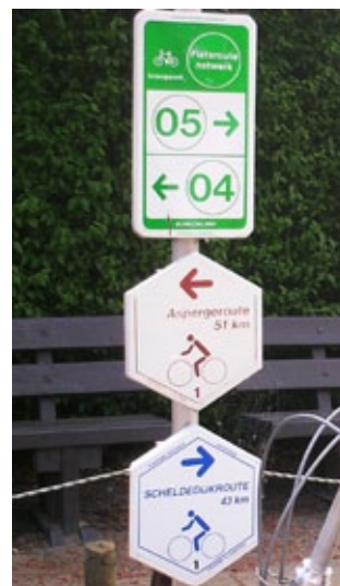
The junction numbering system in Flanders with auxiliary signs indicating thematic routes.

First developed in Flanders, the junction numbering system is now used across the Netherlands and neighbouring regions of Germany. In this scheme consecutive numbers are allocated to all junctions of the network, serving – in addition to the destination name shown on the sign – as both direction signing and destination markers. When planning a route using a cycling map with junction numbers, cyclists can simply note the order of junction numbers along their desired route and then follow the route by travelling from one junction to the next, guided by the junction numbers shown on the signs.