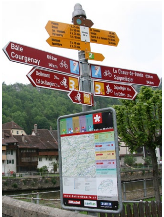
Integrated official signposting system (walking & cycling) in Switzerland.

The maps on www.SwitzerlandMobility.com are referring to the signpost system on location. On the web these routes were also linked to budget accommodation and public transport timetables.