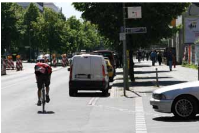
A cyclist preferring the carriageway over the cycle path

Since the 1980s the safety of cycling has been a major focal point of research programmes in Germany, mostly conducted by the Federal Highway Research Institute (BAST). New elements of cycling facilities were reviewed for their specific safety effects. The advised "safety lanes" were a particular focus point; the presumption from the older ERA 1995 that they might be only appropriate at minor car frequencies was disproved. They also work well in roads with a higher volume of traffic, but only where motorists have sufficient space to overtake cyclists.